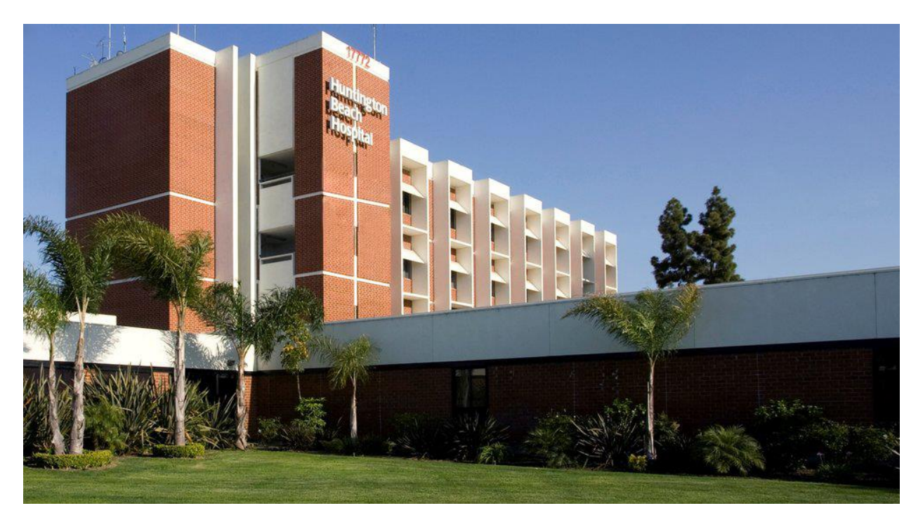
Annual Report and Plan for Community Benefit

Huntington Beach Hospital 17772 Beach Boulevard Huntington Beach, California 92647 714.843.5000